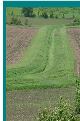
Grassed Filter Strip

Incentive payments are provided to landowners for installing or implementing conservation practices. State or Federal programs are often combined to maximize incentives available to landowners.