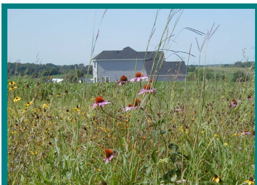
Native Grass Planting