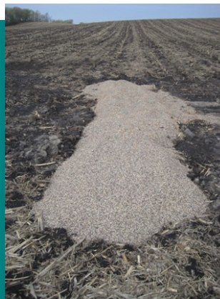
Rock Tile Inlets